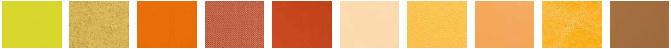
Atlantic 62049 Blazer Dunhurst Cuz58_0 Fame 63077 Breeze Fusion 4303 Fighter 63044 Chatham Summer Yellow C681 Chatham Marigold C685 Chatham Navajo C655 Distressed Brass Dis9071 Prime Canyon 3602-701