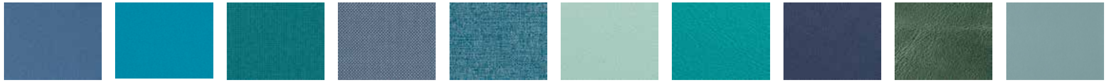
Fighter 66081 Atlantic 66086 Fame 67067 Breeze Fusion 4602 Medley 67006 Chatham Seafoam C649 Chatham Cayman Blue C647 Chatham Nautical C629 Distressed Verde Dis9020 Prime Pacific 3602-402