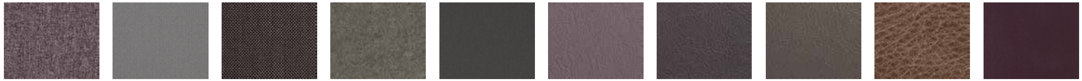
Medley 65011 Fame 60078 Breeze Fusion 4001 Blazer Trevelyan Cuz31 Fighter 60083 Chatham Amethyst C678 Chatham Indian Plum C635 Chatham Phantom C659 Distressed Chocolate Dis9015 Prime Aubergine 3602-602