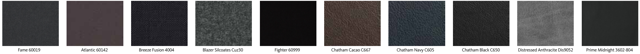
Fame 60019 Atlantic 60142 Breeze Fusion 4004 Blazer Silcoates Cuz30 Fighter 60999 Chatham Cacao C667 Chatham Navy C605 Chatham Black C650 Distressed Anthracite Dis9052 Prime Midnight 3602-804